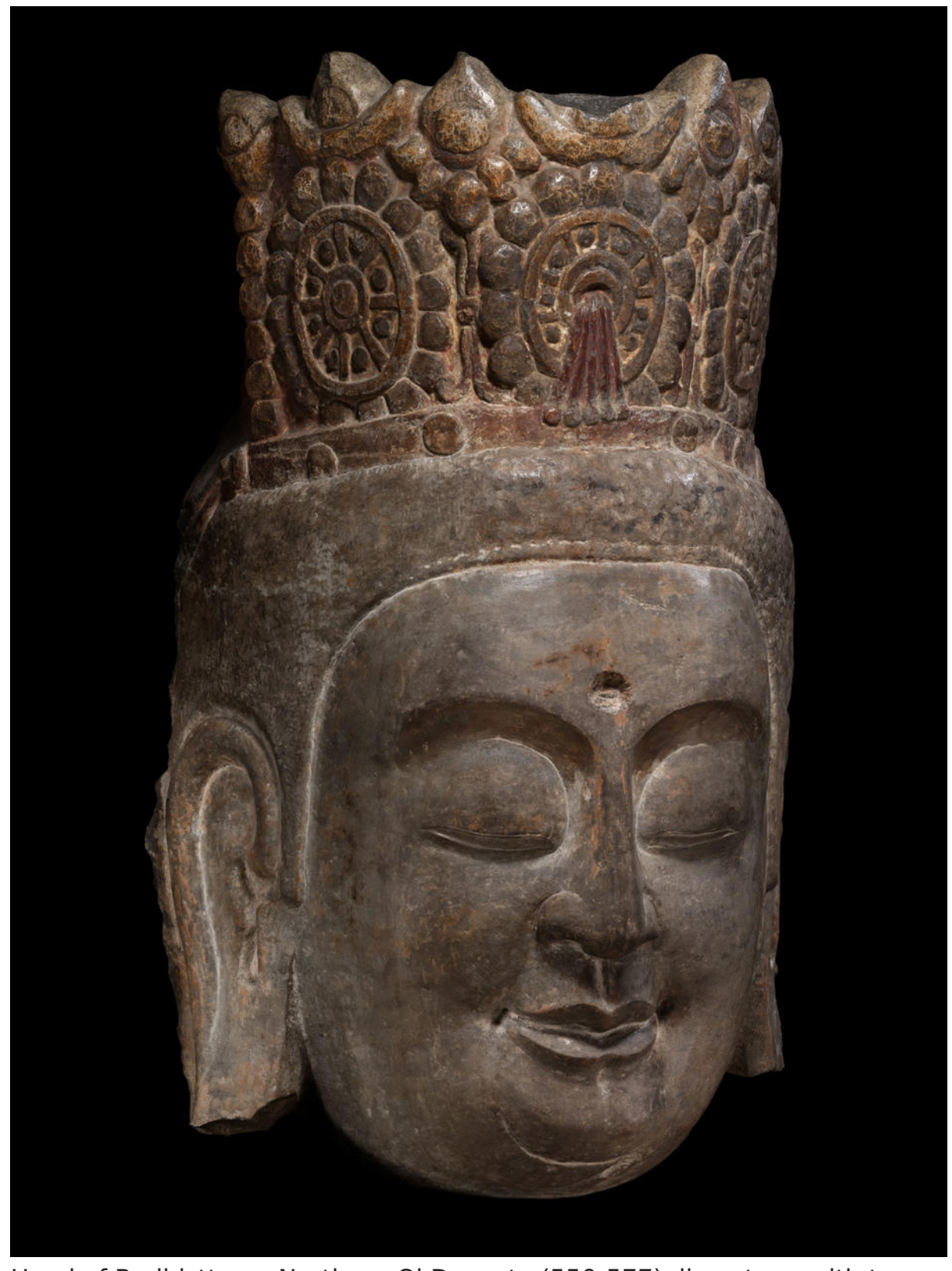
Head of Bodhisttava, Northern Qi Dynasty (550-577), limestone with traces of pigment, Sackler Collection (S0271).